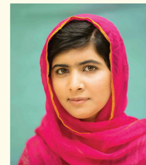
Malala Yousafzai Philosophy, Politics and Economics (2018) - Female education activist and 2014 Nobel Prize Laureate.