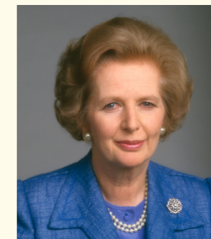
Margaret Thatcher Chemistry (1943) - The first female Prime Minister of the UK.