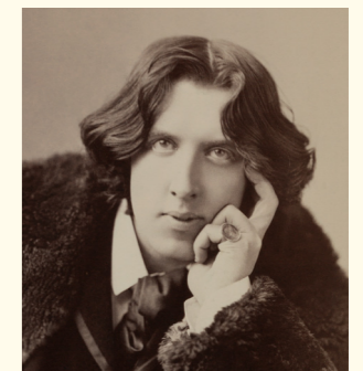
Oscar Wilde Classics (1874) - World-renowned poet and playwright.