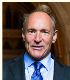
Sir Tim Berners-Lee Physics (1976) - Inventor of the World Wide Web.

Oxford has nurtured many of the world's most influential figures in business, politics, science, and literature. To live and study with the Oxford Institute is to walk in the footsteps of intellectual giants who have shaped our world.