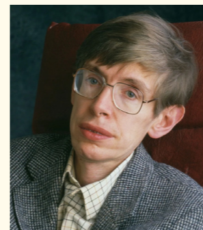
Stephen Hawking Physics (1959) - World-renowned physicist and cosmologist.